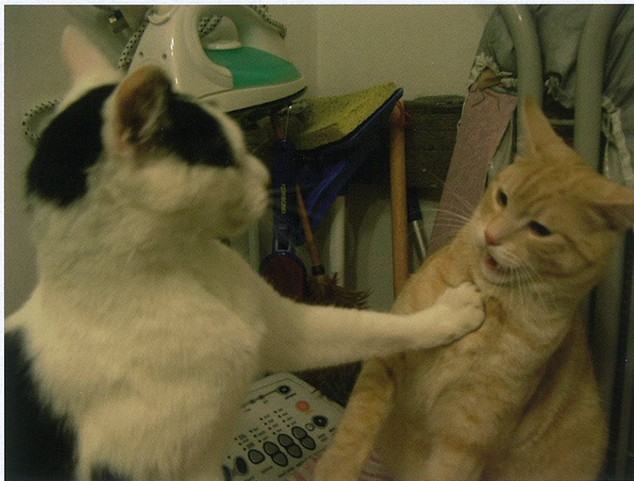
Turbo and Orange